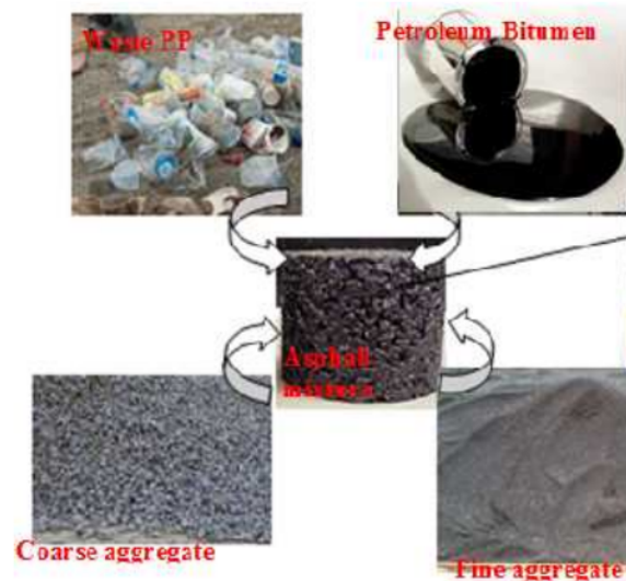
Figure 1. The outline of continuous studies to utilize plastics including waste PP and petroleum bitumen in concrete asphalt production.

At the fundamental level, the continuous research is needed on the development of asphalt mixture containing waste plastics such as waste PP and petroleum bitumen. Figure 1 shows the outline of continuous studies to utilize plastics including waste PP in asphalt concrete.